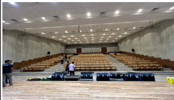
The conference venue Rubert Peiris Auditorium