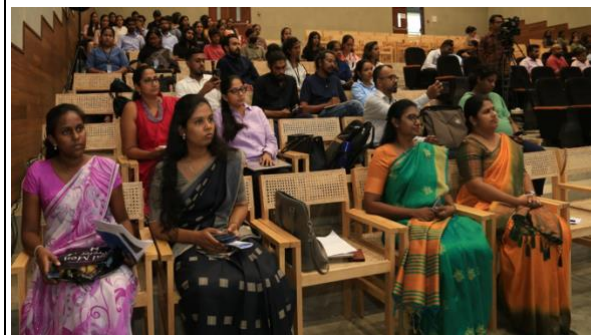
Part of the audience